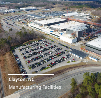
Clayton, NC Manufacturing Facilities